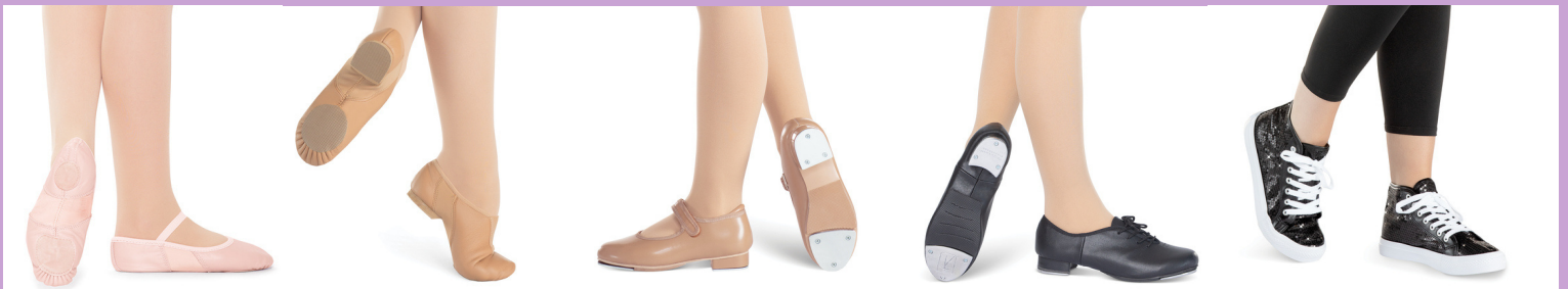
Sparkle High Top Shoes