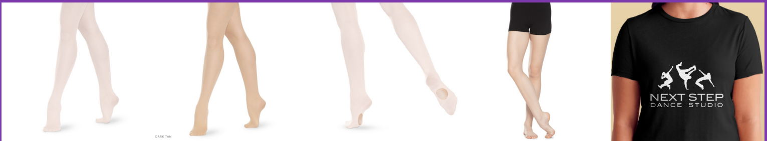
NSDS Hip Hop Shirt