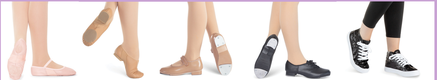
Sparkle High Top Shoes